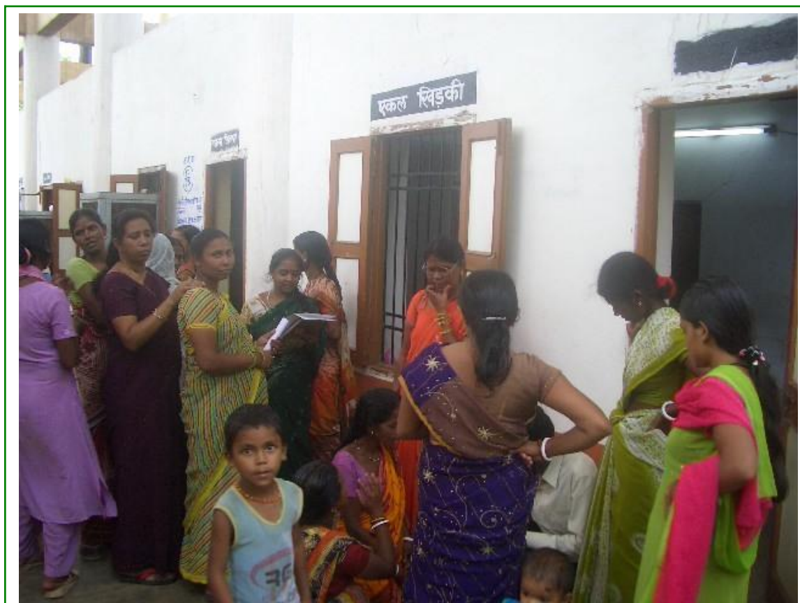
Citizens of Raipur gathered at the RMC to use the Single Window System in order to register their complaints

After the complaint has been registered, it is forwarded to the concerned section/department of zone for redressing. At Corporation level, Public Grievance Redressal cell has been formed.